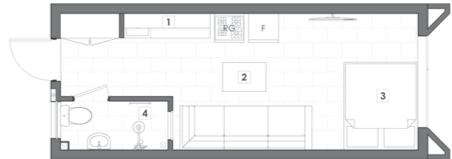
1.Kitchen 2.Lounge 3.Bedroom 4.Washroom