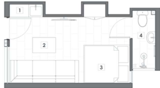
1.Kitchen 2.Lounge 3.Bedroom 4.Washroom